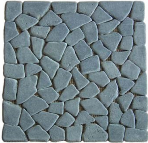
Puzzle Mosaic Black Lava stone – Order code: PZM01A