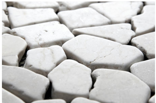
Sample Puzzle Mosaic Interlock White Marble – Order code: PZMI-04-4side