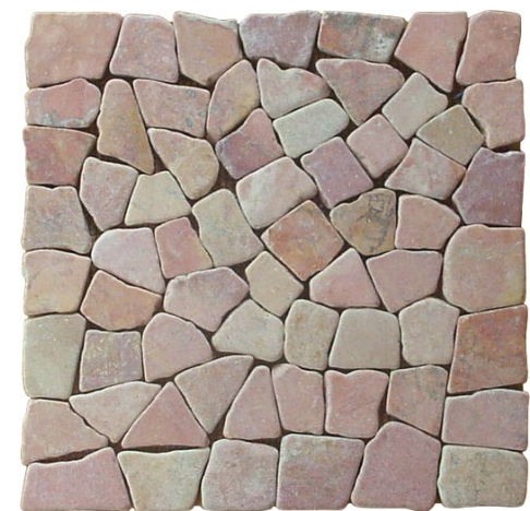
Puzzle Mosaic Red Marble – Order code: PZM09A