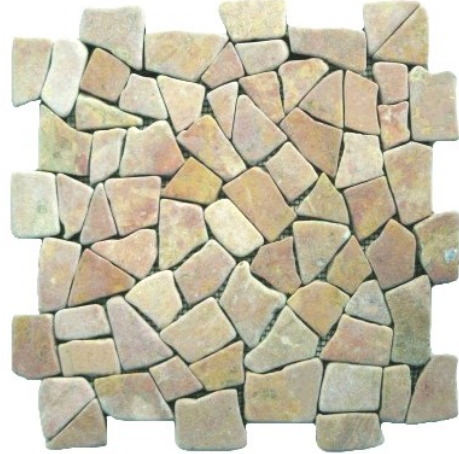
Puzzle Mosaic Interlock Yellow Marble – Order code: PZMI-07-4side