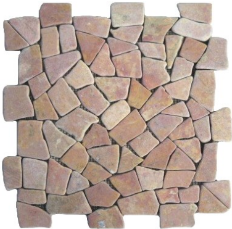
Puzzle Mosaic Interlock Red Marble – Order code: PZMI-09-4side