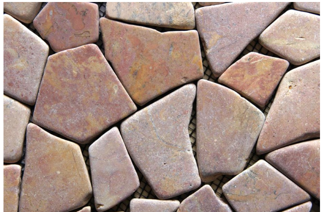
Sample Puzzle Mosaic Interlock Red Marble – Order code: PZMI-09-4side

Size tile 32x32cm - Thickness 10 mm –Weight aprox 20kg/sqm