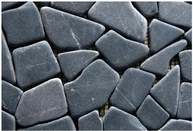
Sample Puzzle Mosaic Interlock Grey Marble– Order code: PZMI-02-4side