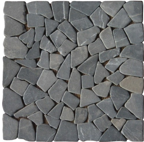
Puzzle Mosaic Grey Marble – Order code: PZM02A