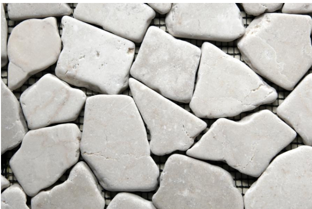
Sample Puzzle Mosaic Interlock White Marble – Order code: PZMI-04-4side