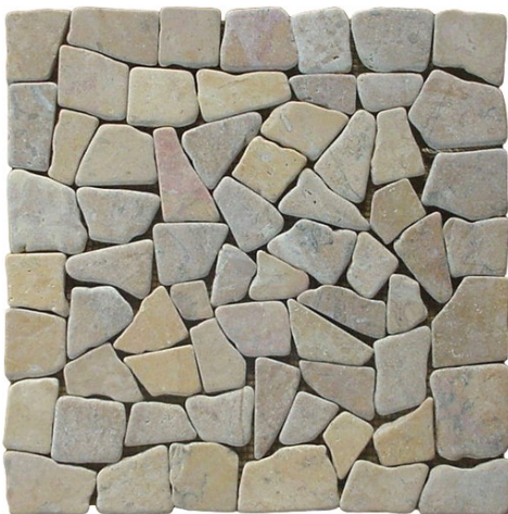
Puzzle Mosaic Yellow Marble – Order code: PZM07A