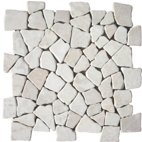
Puzzle Mosaic Interlock White Marble – Order code: PZMI-04-4side