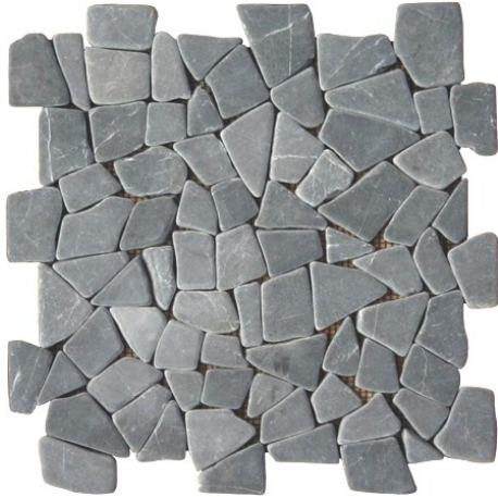
Puzzle Mosaic Interlock Grey Marble– Order code: PZMI-02-4side