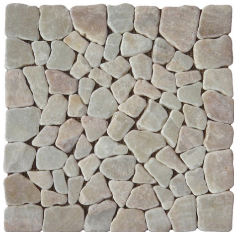
Puzzle Mosaic Onyx Stone – Order Code: PZM03A