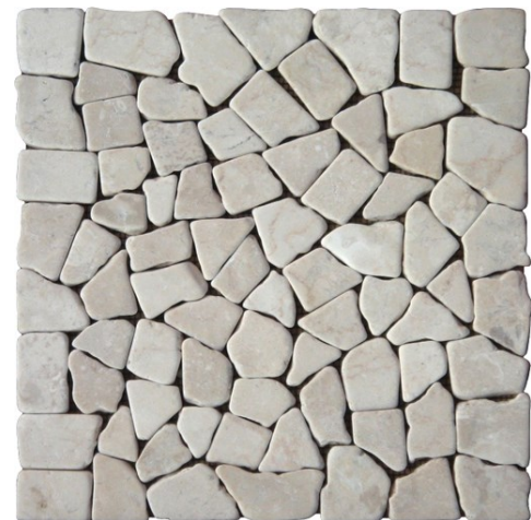
Puzzle Mosaic White Marble – Order code: PZM04A