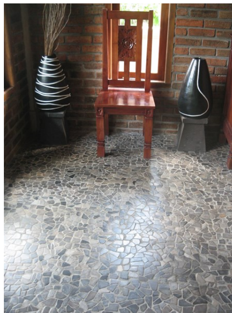
Sample Puzzle Mosaic Grey Marble – Order code: PZM02A. Puzzle mosaic is finished with wax.