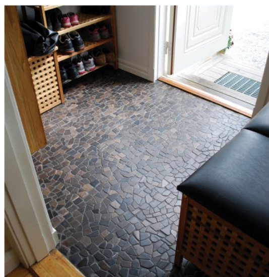
Sample Puzzle Mosaic Grey Marble – Order code: PZM02A. Puzzle mosaic is finished with marble oil.