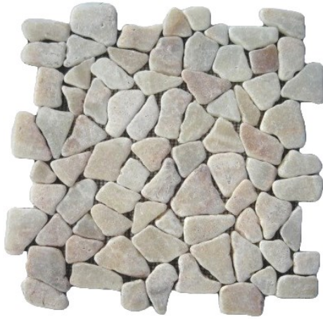
Puzzle Mosaic Interlock Onyx Stone – Order code: PZMI-03-4side