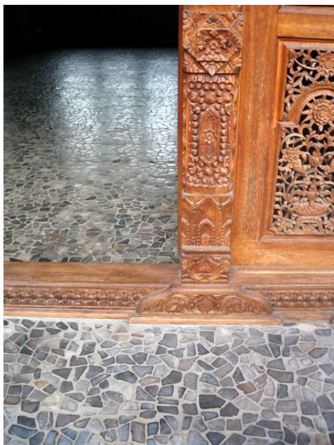
Sample Puzzle Mosaic Grey Marble – Order code: PZM02A. Puzzle mosaic is finished with wax.