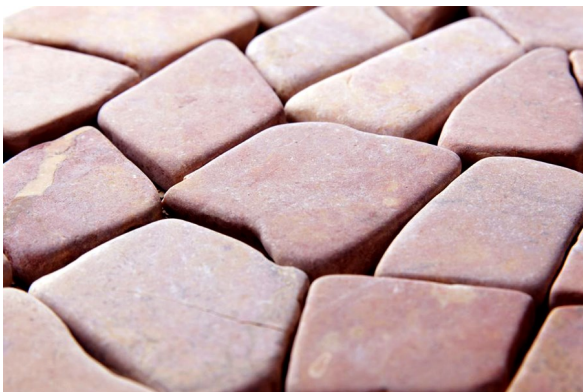
Sample Puzzle Mosaic Interlock Red Marble – Order code: PZMI-09-4side

Size tile 32x32cm - Thickness 10 mm –Weight aprox 20kg/sqm