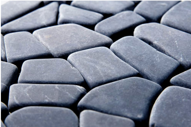
Sample Puzzle Mosaic Interlock Grey Marble– Order code: PZMI-02-4side