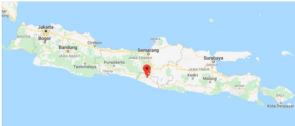
Location Jawa Indonesia for harvesting coconut wood.